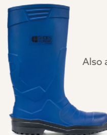
Sentinel Blue: 2012