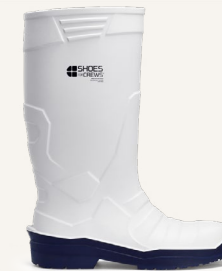
Sentinel White/Blue: 2010/2010B