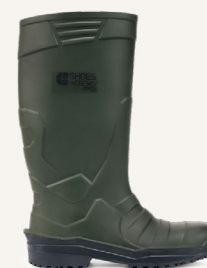
Sentinel Green: 2011