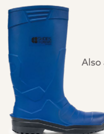
Sentinel Blue: 2012