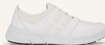
Karina White: 32709