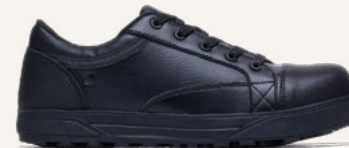
Fergus Black: 78493