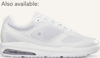
Evolution II White: 28289

Slip resistance test according to EN ISO 20344:2021, conducted by Intertek Testing Services Shenzhen Ltd., in August 2022; on a scale of 0.0 (without slip resistance) to 1.0 (very high level of slip resistance, e.g. on dry carpeted floors). All SFC shoes are fitted with the patented, slip-resistant Shoes For Crews outsole.