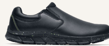
Cater II ECO: 42338