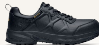
Callan Low: 62203